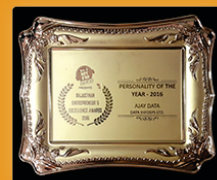
Rajasthan Entrepreneur and Excellence Award 2016