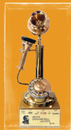
AEGIS Graham Bell Award 2017